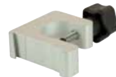
0121181 V Mount Pole Clamp - Small Clamping Width: 14 -25mm