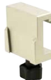
0121184 V Mount Rail Clamp Attaches to most types of 30mm (H) x 10mm (D) Medirail