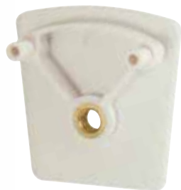
0022171 Universal Mounting Plate