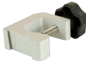
0121182 V Mount Pole Clamp - Large Clamping Width: 16 - 40mm