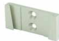
0121180 V Wall Mount