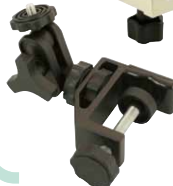
0121200 Universal Mounting Clamp Attaches to round or flat objects up to 3.8 cm thick. Facilitates positioning of the device at any angle