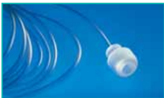
Nasal Sampling Line