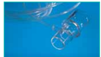
Airway Adapter Sampling Line